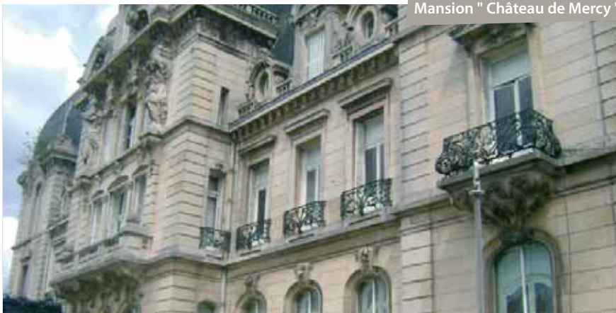
Mansion " Château de Mercy "