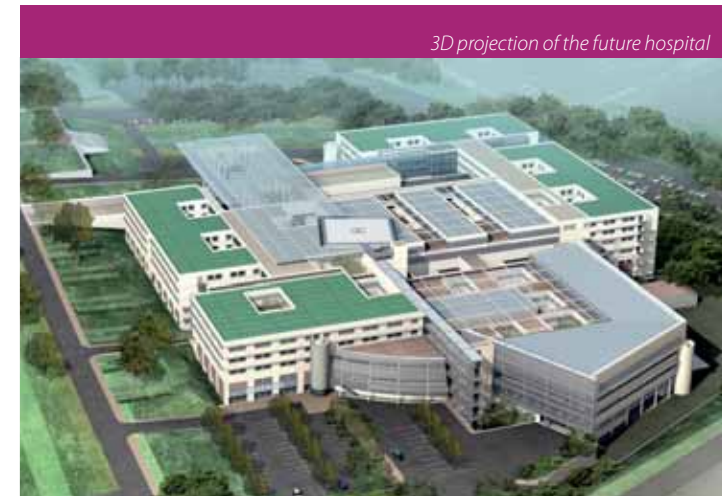
3D projection of the future hospital