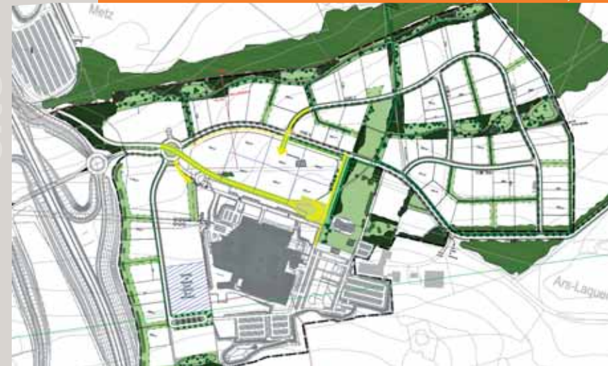
Draft block plan of the Mercy site