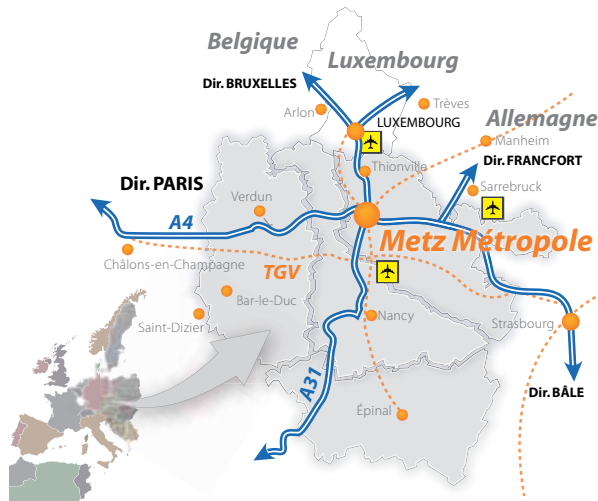
Metz Métropole, ideally located near three borders.

The repurposing of an exceptional site in a green setting, a short-term opportunity. Following the re-qualification of a former military site, the Mercy site offers an exceptional development capacity over 58 hectares: